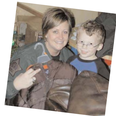
Vanderburgh County Sheriff's Office Coat Distribution at the Goodwill Family Center