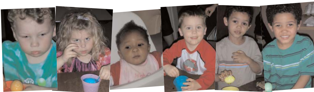
Helping out the Easter Bunny at the Goodwill Family Center