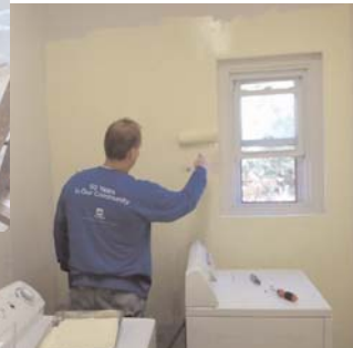
ALCOA Workers Sprucing up the Goodwill Family Center