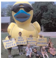
The children residing at Goodwill Family Center reminded everyone to adopt ducks for the 14th Annual Ducks on the Ohio adopt-a-duck race in August 2008.