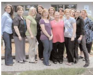
Volunteers gather to celebrate their work on the Bright Spaces project.