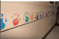
Children at the Family Center line up for their chance to put their hands in paint and add their handprints to the border around the GFC Dining Room. Resident rooms and the dining area were painted and refurbished by members of the Remember November 6th Committee. Committee members, some of whom were directly impacted by the November 6, 2005 tornado, planned the project as a way to productively honor those lost in the tragedy.